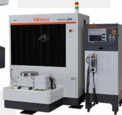
MACH-3A 653 Item No. 360-412

List Price $187,838.00 USD STARTING AT $160,000 USD