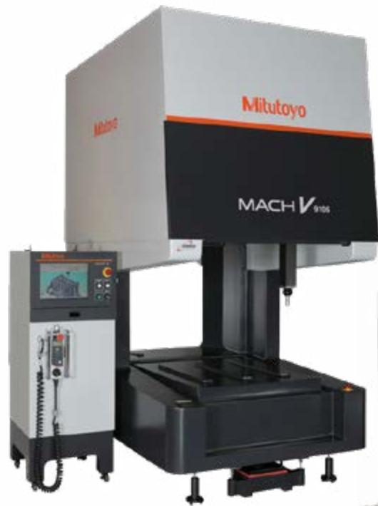
MACH-V9106 Item No. 360-224-10

List Price $187,838.00 USD STARTING AT $160,000 USD