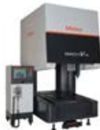
MACH-V9106 In-line Type CNC CMM Pre/Post Machining Feedback