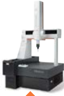
Crysta-Apex-V High-Performance CNC CMM