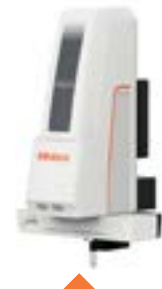
MACH Ko-ga-me Agile Measuring System