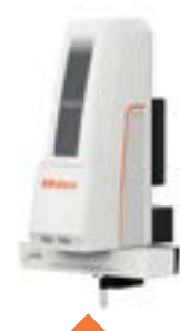
MACH Ko-ga-me Agile Measuring System