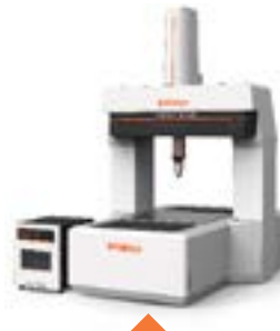
Legex Ultra High-Accuracy CNC CMM Fixed-bridge type