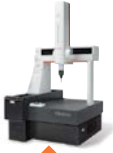
Crysta-Apex-V High-Performance CNC CMM