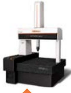
STRATO-Apex High-Accuracy CNC CMM Moving bridge-type