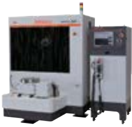
MACH-3A In-line Horizontal Arm CMM