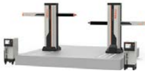
CARBstrato/CARBapex Horizontal Arm Measuring Systems