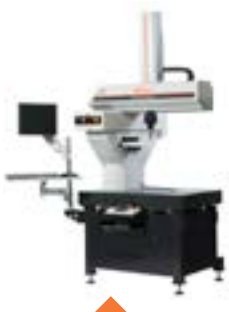
MiSTAR 555 Shop floor CMM

Mitutoyo offers a comprehensive line-up of CMM systems, probing systems and powerful software.