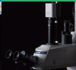
Small Tool Instruments and Data Management